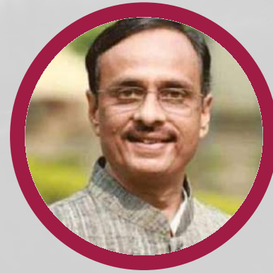
Dr. Dinesh Sharma

Member of Parliament Former Deputy CM Uttar Pradesh